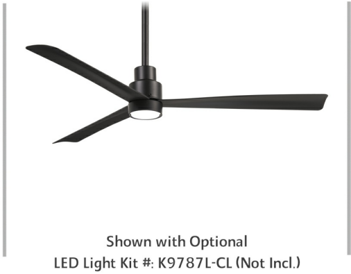
Shown with Optional LED Light Kit #: K9787L-CL (Not Incl.)