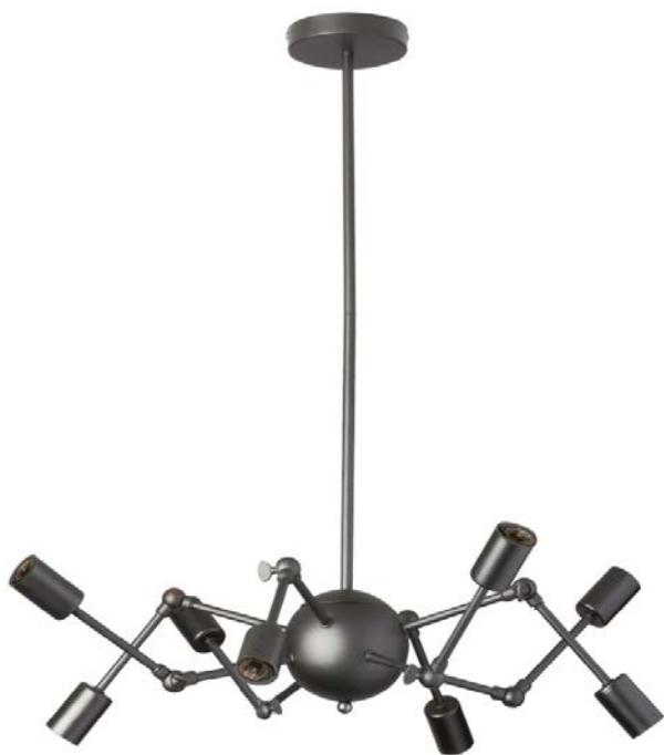
8 Light Chandelier With Adjustable Arms, Matte Black Finish

Height 10 Width/Length 28 Depth 28 Weight 8