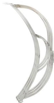
Table Legs (Folded)