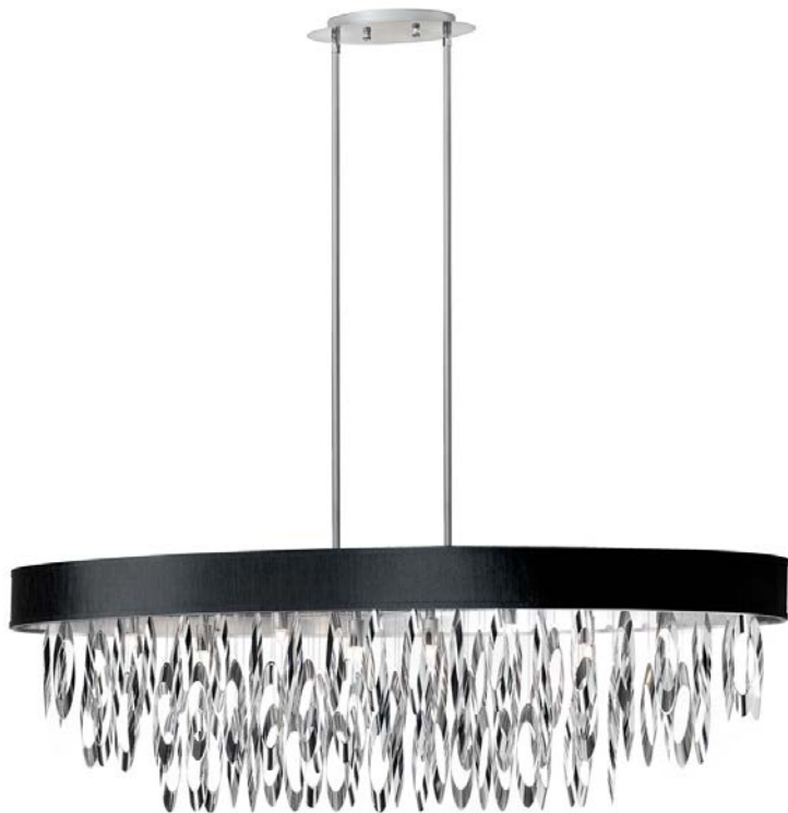
8 Light Oval Chandelier with Black Shade Polished Chrome Finish

Height 15 Width/Length 42.5 Depth 15 Weight 16