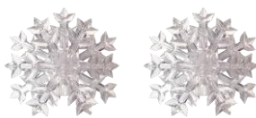
Snowflake Topper 2x