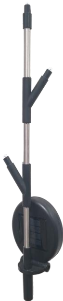
Top Stake 1x