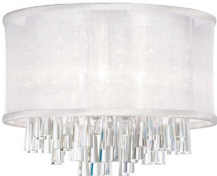
4 Light Crystal Flush Mount Fixture, Polished Chrome, White Organza Drum Shade

Height 10 Width/Length 16 Depth 16 Weight 10