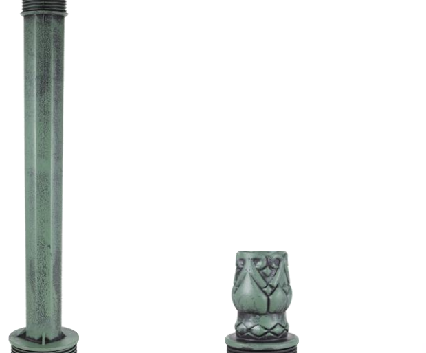
Post Connector 1x