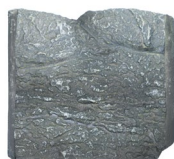
Fountain Back Door 1x