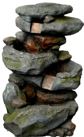
Fountain (3 LED lights pre-installed) 1x