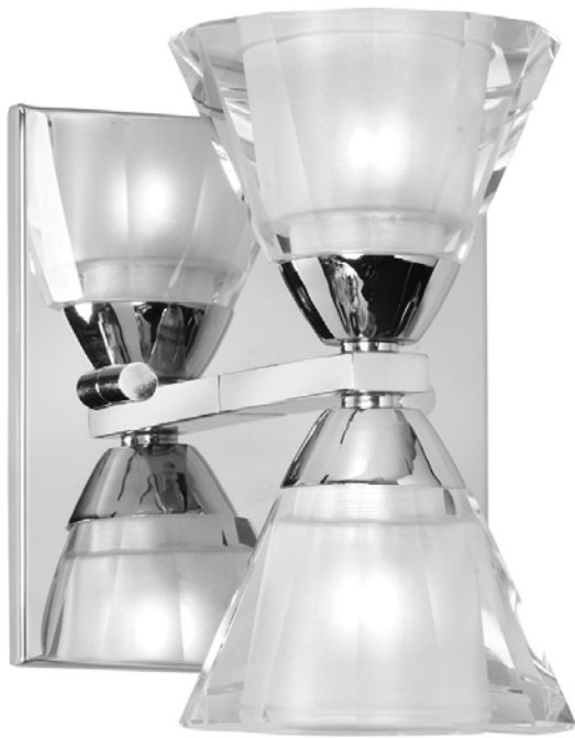
2 Light Wall Sconce, Polished Chrome, Optical Crystal

Height 7.5 Width/Length 4.25 Depth 3.5 Weight 2.9