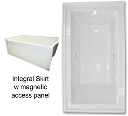
Integral Skirt w magnetic access panel