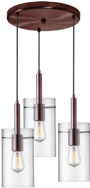
3 Light Pendant, Oil Brushed Bronze Finish, Clear Glass Shade

Height 16.5 Width/Length 5.5 Depth 5.5 Weight 10