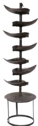
Lower Fountain Topper 1x