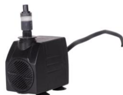
Fountain Pump 1x

*Pump may be packaged separately in an outer box located in the outer Styrofoam packaging.