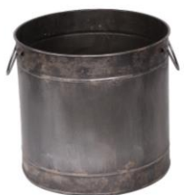
Fountain Base 1x