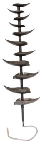
Upper Fountain Topper 1x