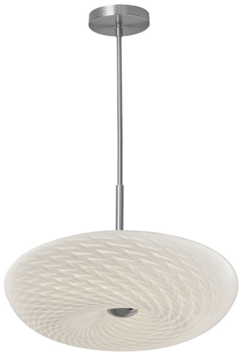
LED Pendant with Mackerel Glass

Height 4.5 Width/Length 16 Depth 16 Weight 10