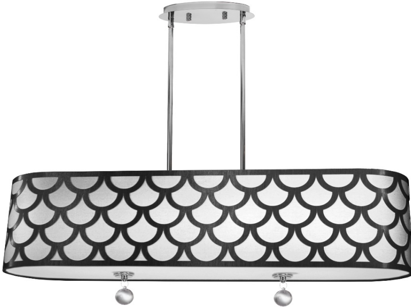
4 Light Oval Pendant, Polished Chrome Finish, Black & White Shade

Height 9 Width/Length 35 Depth 9 Weight 12