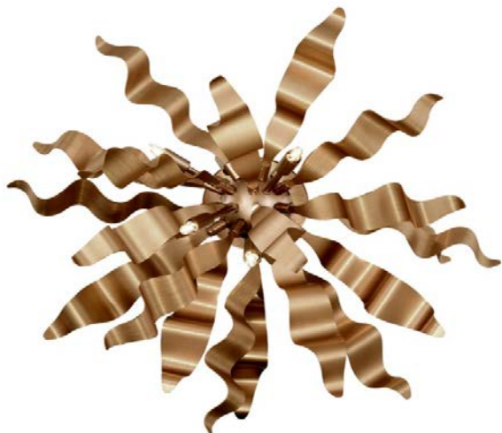
5 Light Flushmount with Wavelet Ribbons, Vintage Bronze Finish

Height 10 Width/Length 16 Depth 16 Weight 10