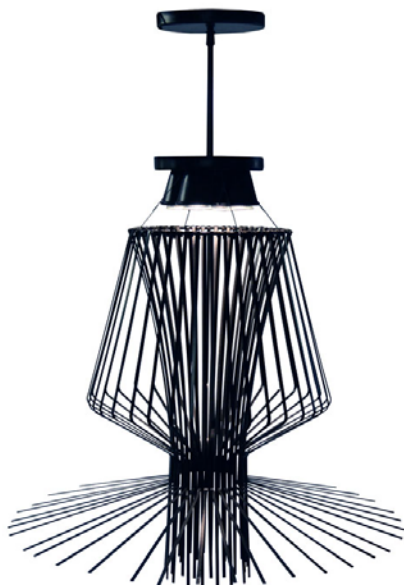
3 Light Wire Chime Pendant, Painted Black Semi-Gloss

Height 34.5 Width/Length 29 Depth 29 Weight 18