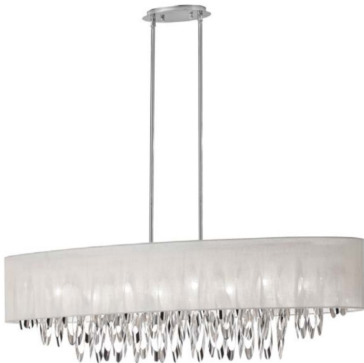
8 Light Oval Chandelier with Cream Shade Polished Chrome Finish

Height 15 Width/Length 42.5 Depth 15 Weight 16