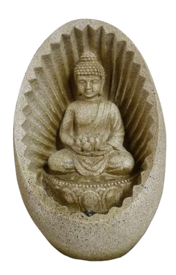
Fountain (Pump & LED lights pre-installed) 1x

This warranty is void if the product has been damaged by accident, misuse, negligence, improper installation and/or modifications have occurred. This includes any and/or all defects arising out of freezing water damage, hard water damage, failure to keep the unit clean and free of harmful additives such as bleach, chlorine, etc.... which affects the paint and/or parts. This warranty also does not cover any additional charges or installation, removal, disposal and/or shipping costs or consequential damage associated with any warranty claim.