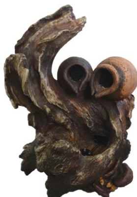
Fountain (Pump & LED lights pre-installed) 1x