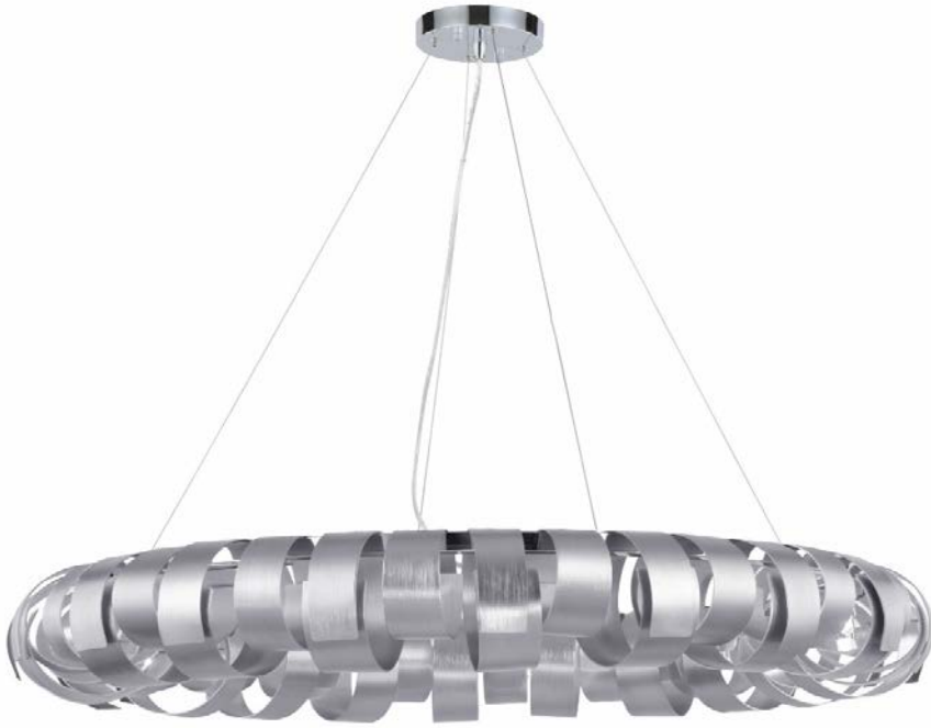
8 Light Pendant, Silver Aluminum Ribbons

Height 5.5 Width/Length 28 Depth 28 Weight 13