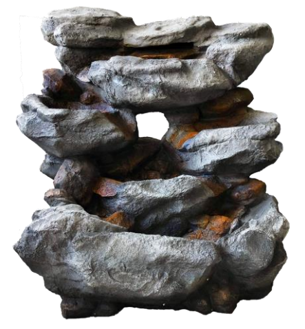
Fountain (5 LED lights pre-installed) 1x