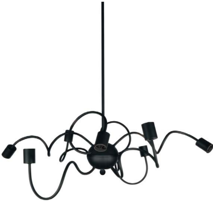
8 Light Oval Pendant, Matte Black Finish

Height 12 Width/Length 32 Depth 18 Weight 12