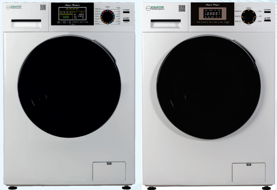
EW 835 + ED 870 Side by Side