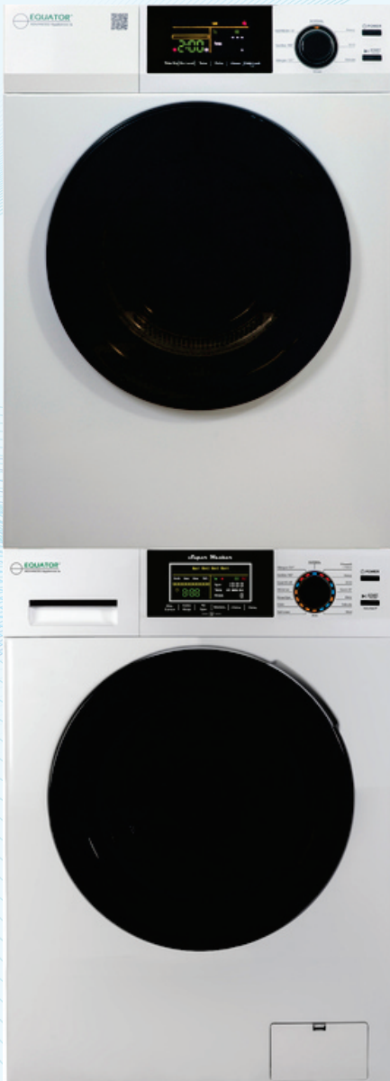
EW 835 + ED 870 Stack