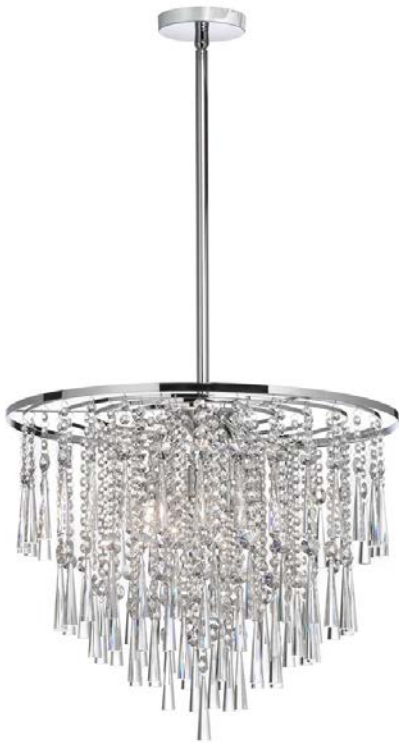
8 Light Crystal Chandelier, Polished Chrome

Height 17 Width/Length 20 Depth 20 Weight 15