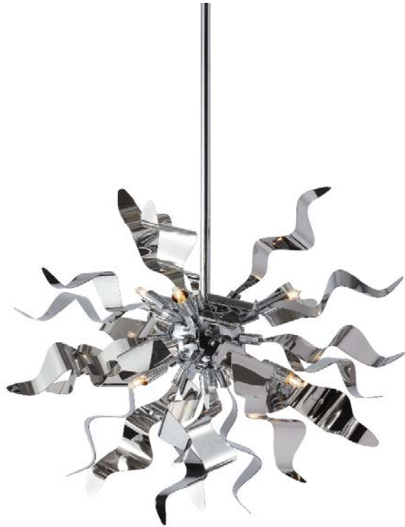
6 Light Pendant with Wavelet Ribbons, Polished Chrome Finish

Height 20 Width/Length 20 Depth 20 Weight 12