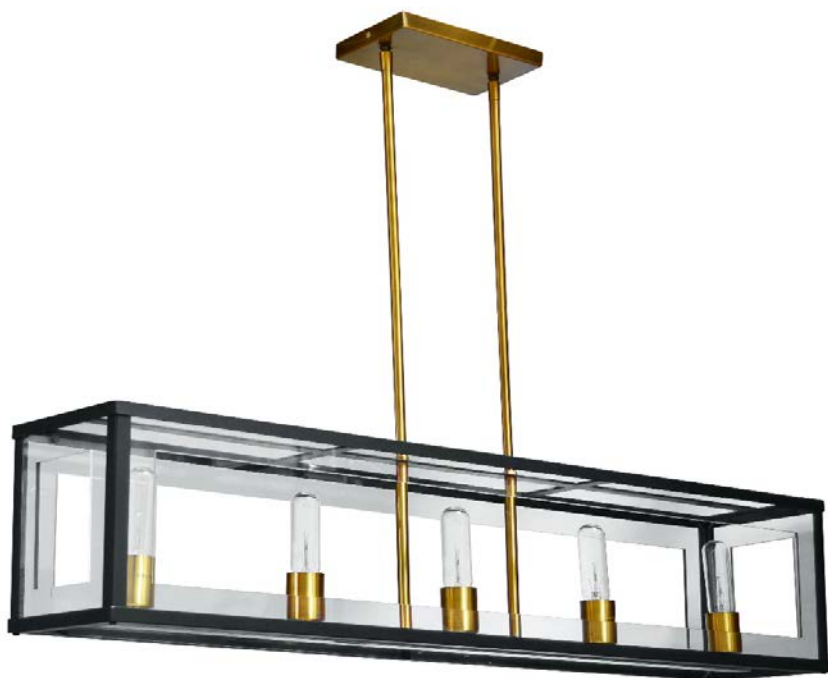
5 Light Acrylic Horizontal Pendant, Matte Black / Vintage Bronze Finish, Clear Acrylic Panels

Height 9 Width/Length 38 Depth 7.5 Weight 16