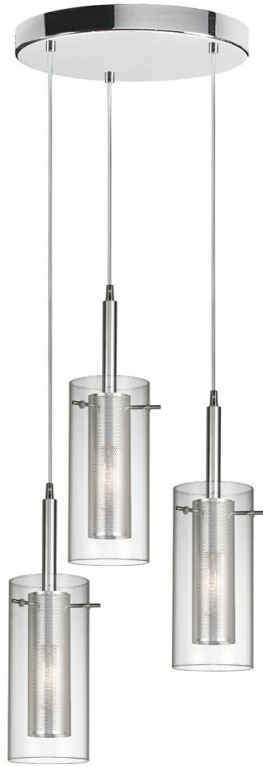
3 Light Round Pendant, Polished Chrome, Clear Glass / Steel Mesh

Height 11 Width/Length 6 Depth 6 Weight 14