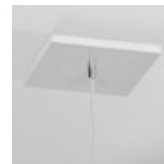
low-profile square canopy