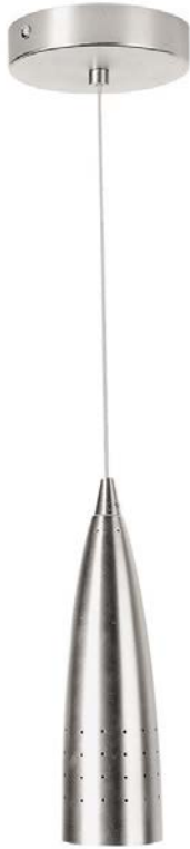
1 Light Pendant, Satin Chrome

Height 10 Width/Length 2.5 Depth 2.5 Weight 3