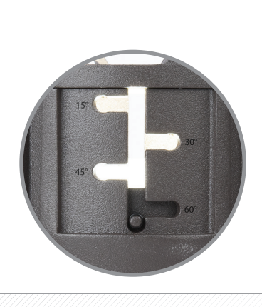
Adjust Beam Angles Presets at 15°, 30°, 45°, 60°