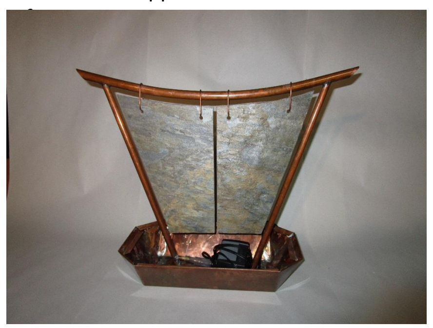
5. Fill with water to ¼" below top of pan. Do not over fill.