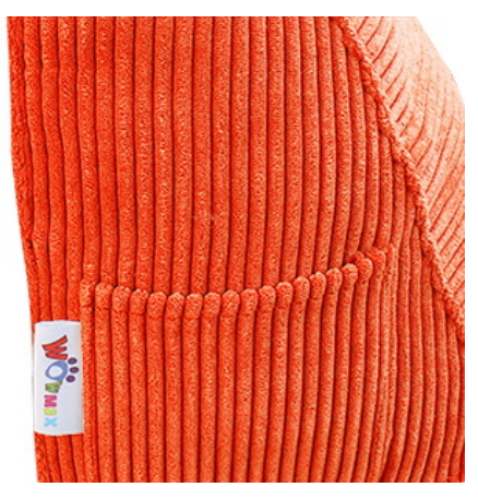
High-quality Corduroy Fabric

reduce snoring, helps to improve blood circution and promotes a healthy posture.