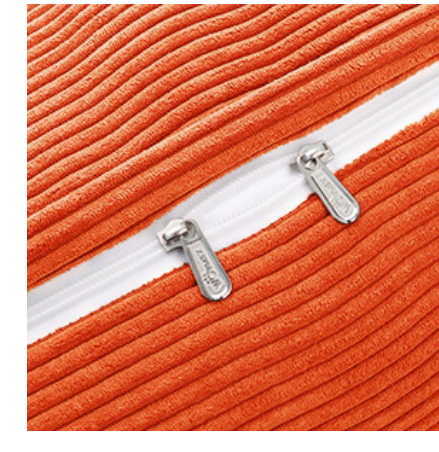
Removable pillow cover

The product adopts a movable button design and you can easily unloop the buttons, fixed on the pillow inner, from buttonholes sewn on the pillow cover and then remove the cover for machine washing purposes.