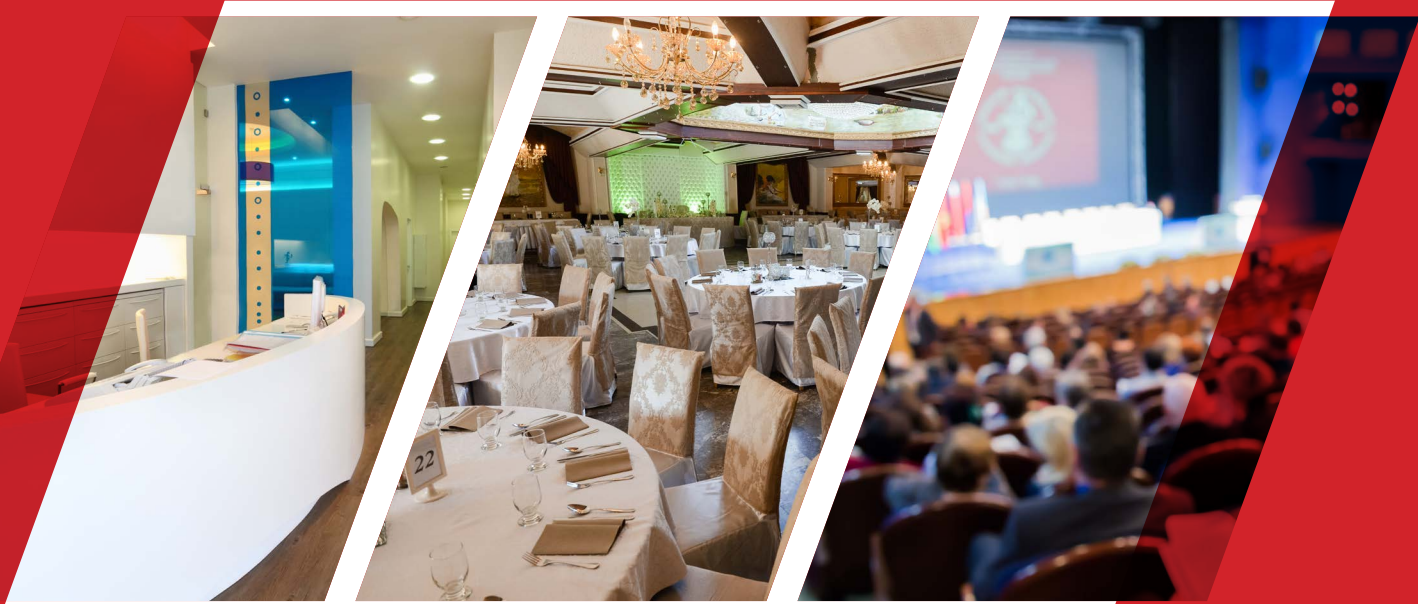
The EML series can be installed in many applications such as hallways, hospitals, schools, restaurants, event venues and more.