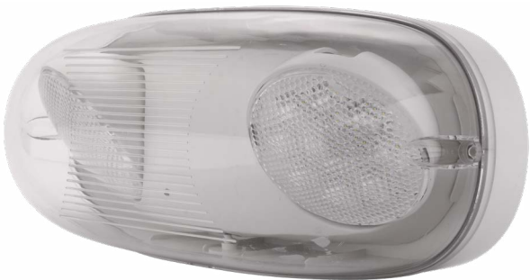
Adjustable head lamps with 100° tilt and 100° rotation to aim the light where it is most needed.