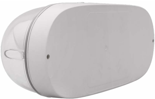
Easy installation with mounting plate for access to wiring compartment. Knock outs provide pattern to be installed into a standard junction box.