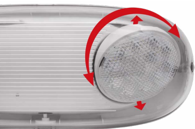
100° TILT WITH 100° ROTATION