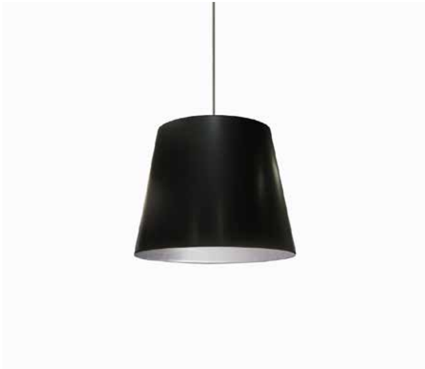
1 Light Tapered Drum Pendant with Black on Silver Shade

Height 20 Width/Length 20 Depth 20 Weight 6