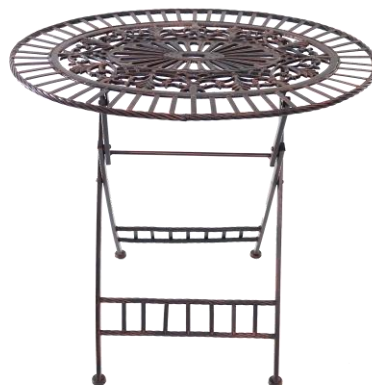
Table Top 1x