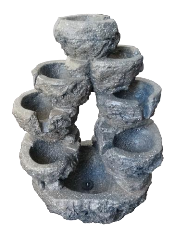
Fountain (Pump & LED lights pre-installed) 1x

This warranty is void if the product has been damaged by accident, misuse, negligence, improper installation and/or modifications have occurred. This includes any and/or all defects arising out of freezing water damage, hard water damage, failure to keep the unit clean and free of harmful additives such as bleach, chlorine, etc.... which affects the paint and/or parts. This warranty also does not cover any additional charges or installation, removal, disposal and/or shipping costs or consequential damage associated with any warranty claim.