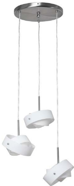
3 Light Round Pendant, Satin Chrome, White Frosted Glass

Height 7 Width/Length 17 Depth 17 Weight 10