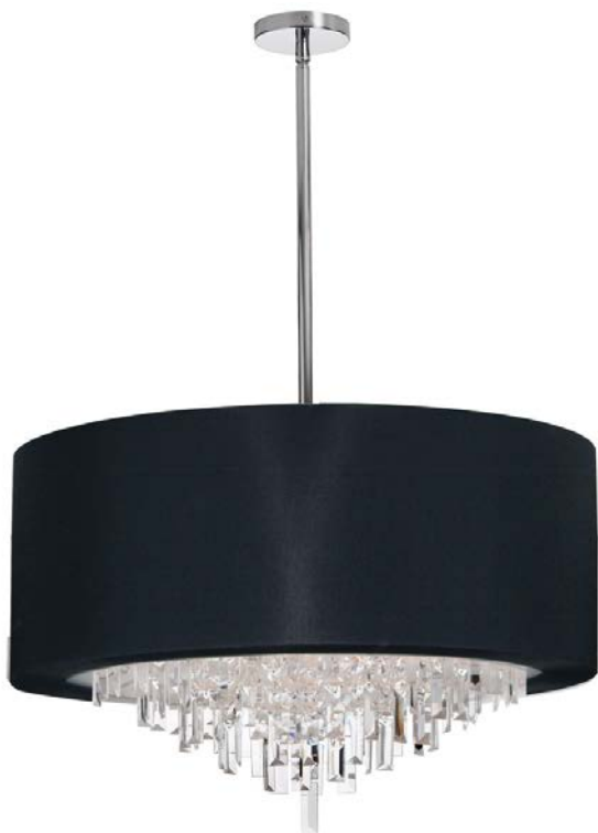
8 Light Crystal Chandelier, Polished Chrome, Black Lycra Drum Shade

Height 18 Width/Length 25 Depth 25 Weight 18