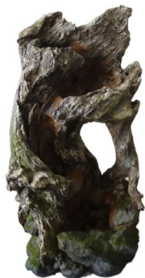
Fountain (3 LED lights pre-installed) 1x