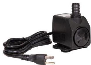
Fountain Pump 1x