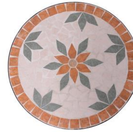
Table Top 1x