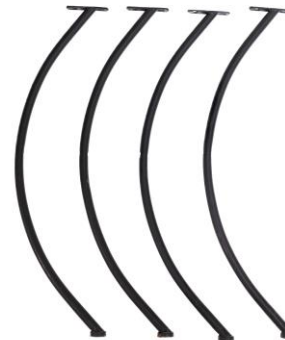
Table Legs 4x