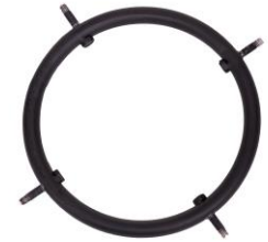
Center Support 1x