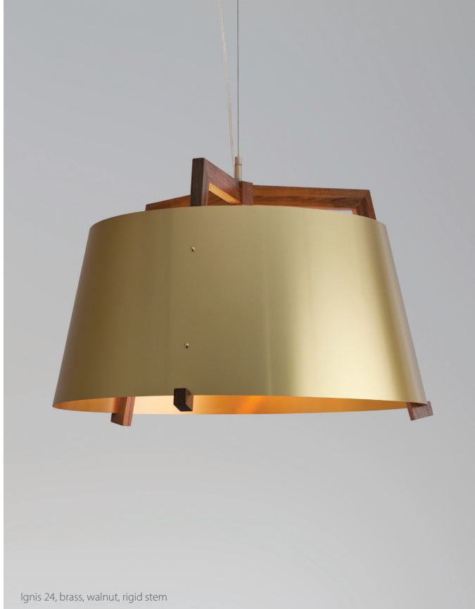
Ignis 24, brass, walnut, rigid stem