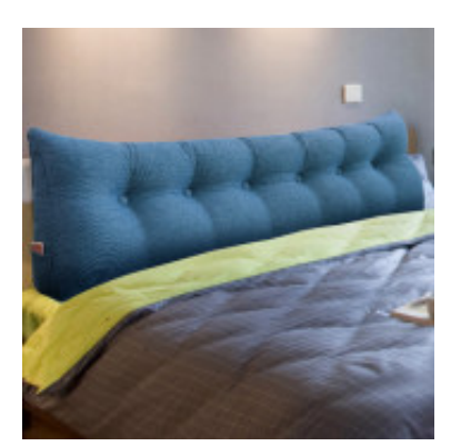
Soft bed backrest support

Placed the headboard pillow on the bed in the bedroom, the new style and warm feeling will make your bedroom look new and