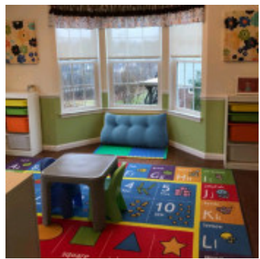
Refurbishing or making a personalized sofa

It's amazing to put this back cushion on the student's dormitory bed! Children can sit up in bed and do some reading,