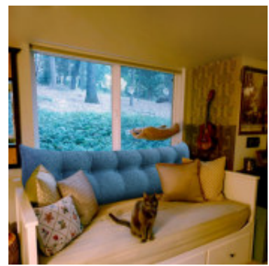
Children, kids, toddler or infant's room safety cushion

When your sofa back relax cushion is too old to be used or repaired, or you want to make a personalized sofa with an