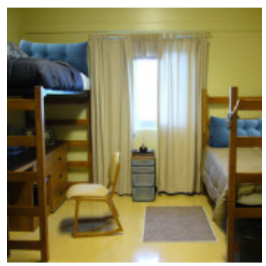
Student dormitory support cushion

Placed the headboard pillow on the bed in the bedroom, the new style and warm feeling will make your bedroom look new and