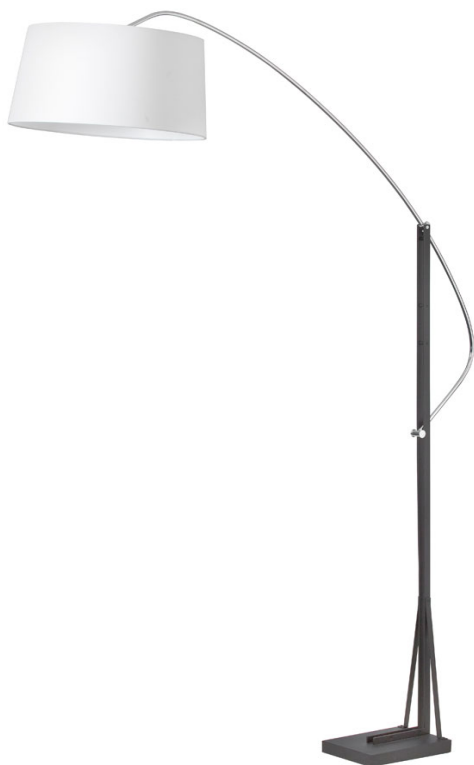
Arc Floor Lamp, Polished Chrome / Matte Black

Height 83 Width/Length 58 Depth 18 Weight 26