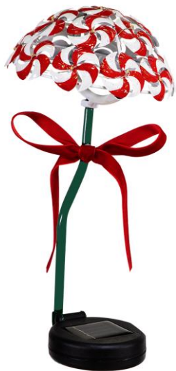
Top Stake 1x