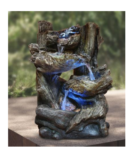
Relax and enjoy your new fountain.

8. Congratulations, your fountain is now complete. Don't forget to add water regularly as water will evaporate over time.