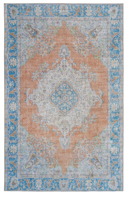
BOH10-67 | Copper