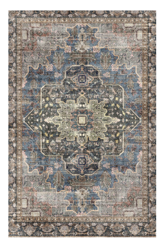
BOH16-22 | Navy