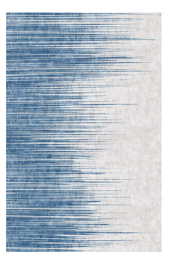
BOH12-17 | Blue