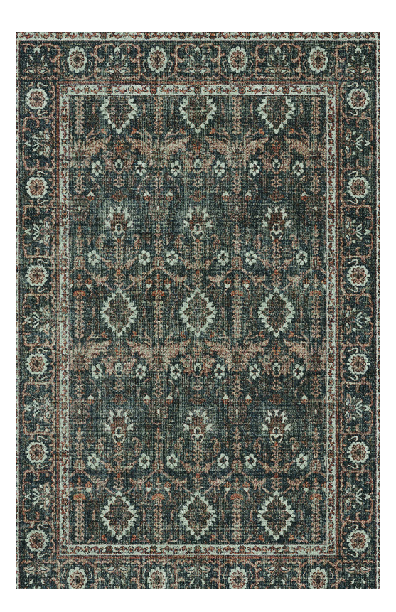
BOH17-91 | Teal