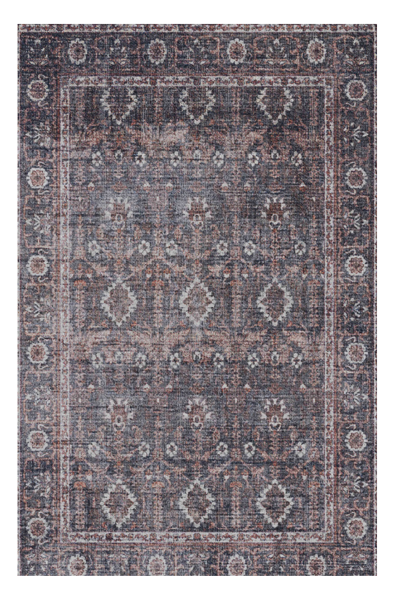
BOH17-22 | Navy