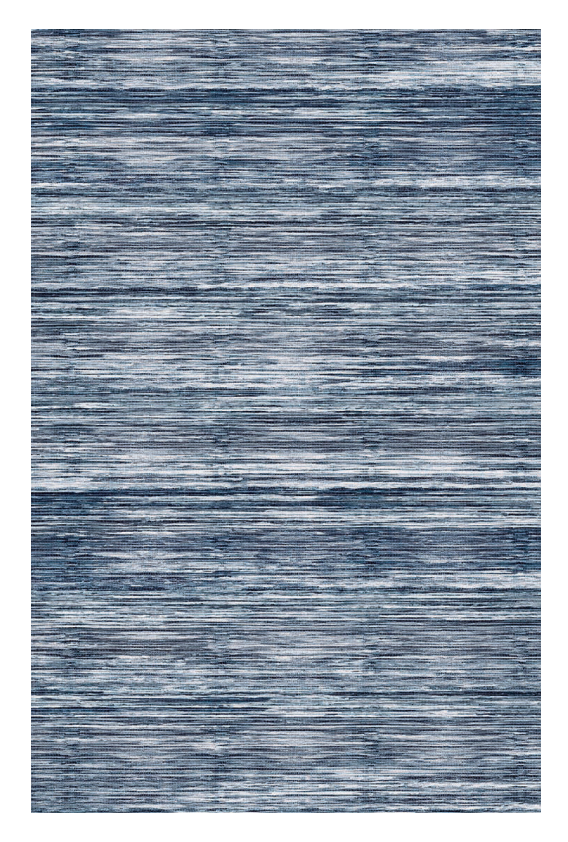
BOH14-10 | Denim