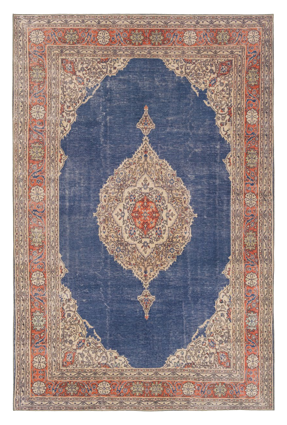
BOH05-10 | Denim