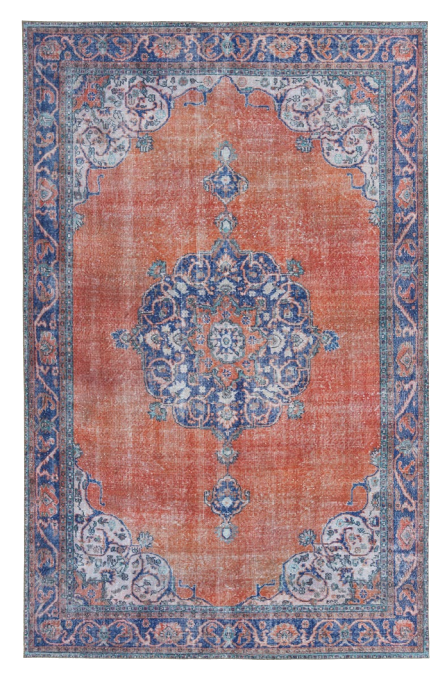
BOH11-53 | Paprika