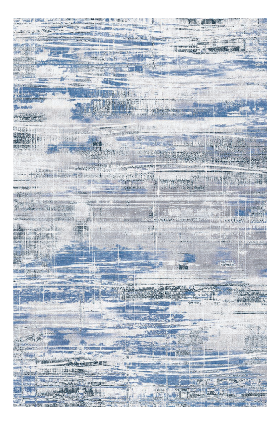
BOH13-17 | Blue