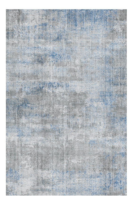
BOH15-17 | Blue