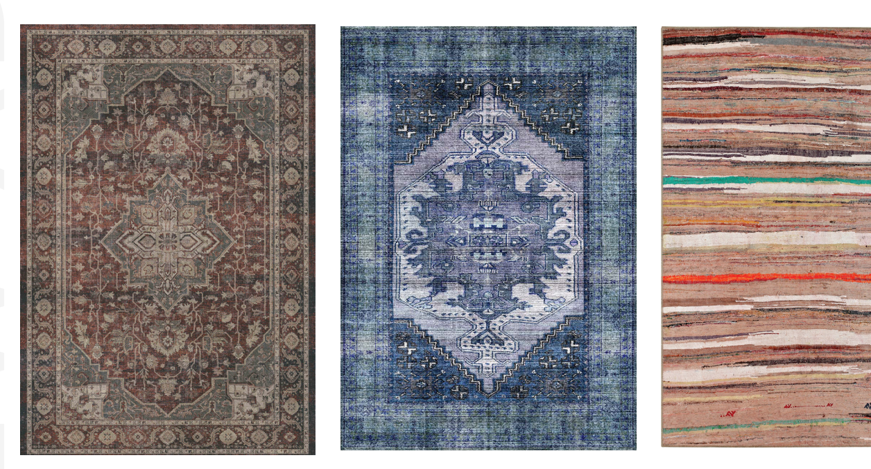
BOH21-86 | Multi