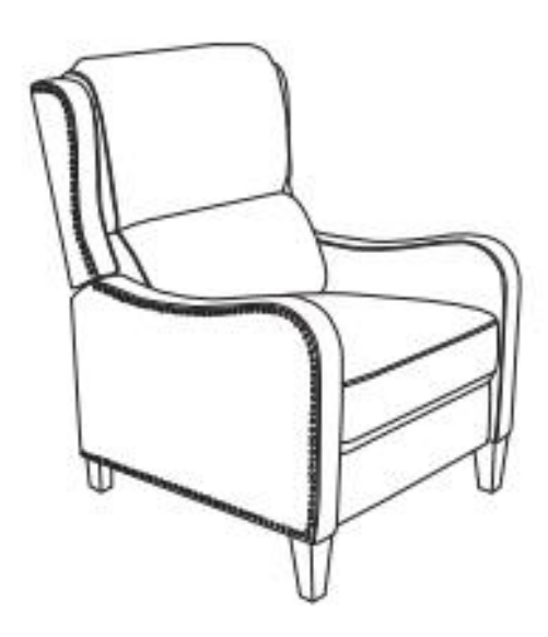
ITEM NO. RCLB0052