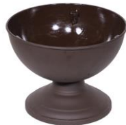
Fountain Basin 1x