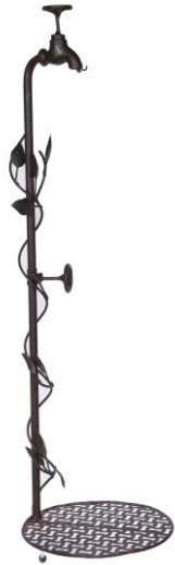
Fountain Top 1x