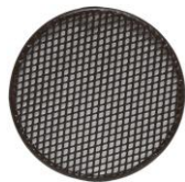
Splash Guards 6x