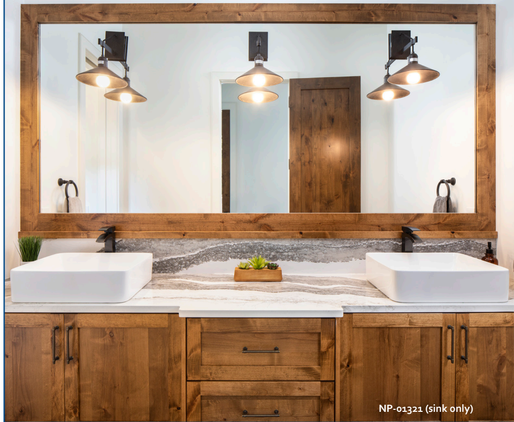
NP-01321 (sink only)

Yes, drains from other manufacturers will be compatible with our porcelain vessel sinks.