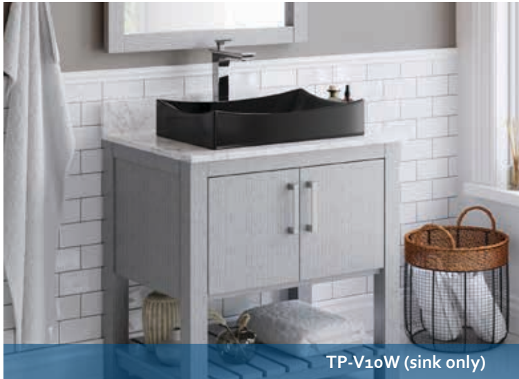
TP-V10W (sink only)