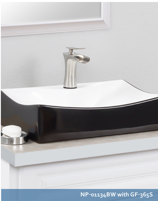
NP-01134BW with GF-365S