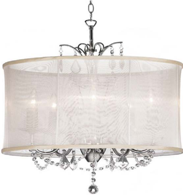
5 Light Crystal Chandelier, Polished Chrome, Oyster Organza Shade

Height 19 Width/Length 20 Depth 20 Weight 12